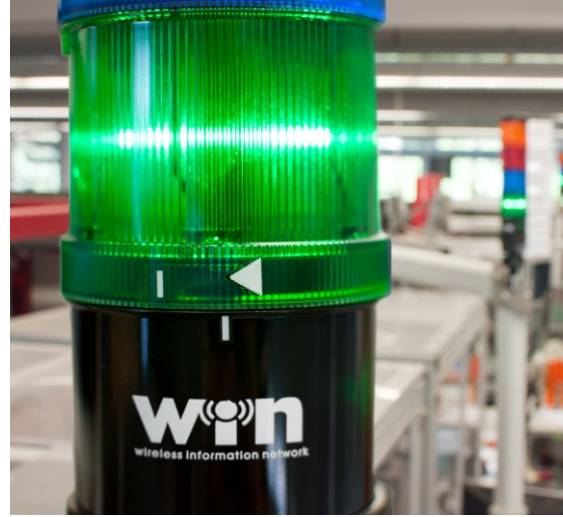
TRW Blumberg has been using WERMA signal towers for years and thereby ensures simple and effective machine monitoring and transparency in Production.

TRW has become an exemplary user of the WIN system giving much valuable feedback to the WIN development team. In this way modifications and new ideas to the product hardware and software can be introduced quickly.