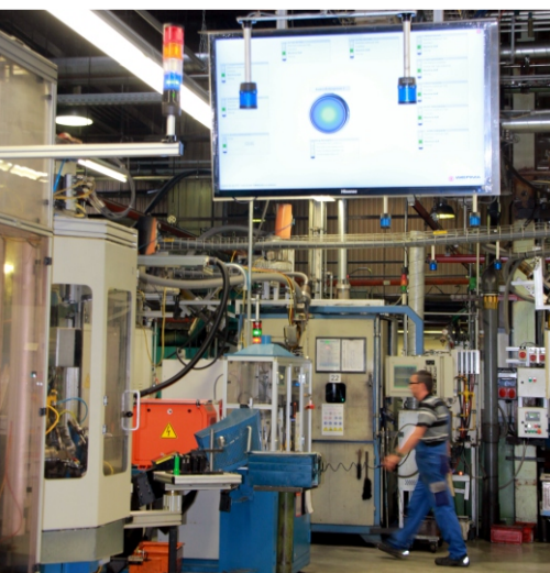
TRW Automotive insists on signal devices from WERMA. The automotive manufacturer has installed large plasma screens in various locations to display machine monitored data.

In no time it was clear that WIN was meeting all of TRW's expectations in terms of flexibility, standardisation and ease of expansion of the system. Data is transmitted wirelessly to a central master PC – no complex interface with the individual machine is required as the system simply transmits data from the existing machine tool signal tower.